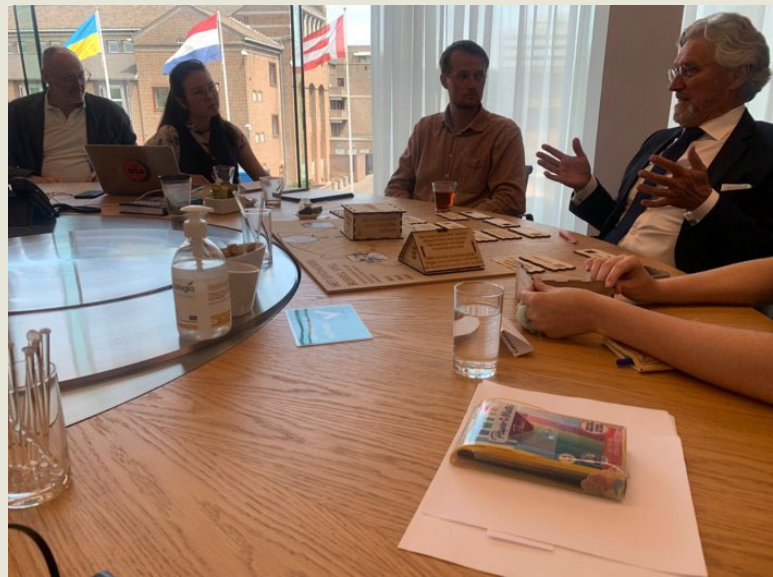
fig.3 session one mayor

From my research I have learned about the role of language within complexity , and how we now use buzzwords, jargon, and container content to deal with it but it results in us staying too abstract . I got particularly interested in Wittgenstein's theory where he states meaning is use , this situatedness of words seems to have great importance. I see potential in focusing more on this situatedness of our communication and use, making and embodiment to do so.