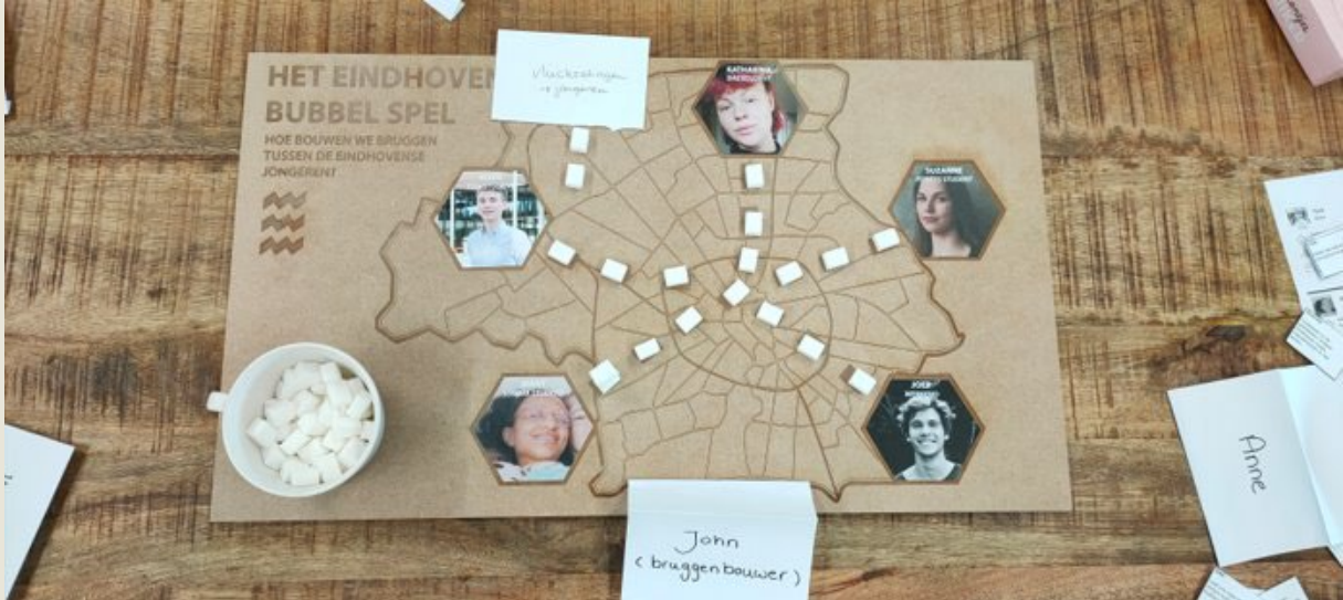
fig.2 session one mayor

From my research, I learned much about how we use our language, especially in the field of design and government . I also reflected on my own use of language and my relationship with it. Because I am dyslectic , I perceive language differently. I deal with complexity by making and embodiment. An example of this is the project I did with the municipality and Europe , where the idea is that young people, called future mentors , are mentoring the leaders of the city to give them a perspective of a future city. We mentored the mayor of Eindhoven and used design to assist the discussion. For the first conversation, we created a game to embody all the bubbles of young people in Eindhoven the mayor had to connect these bubbles (fig 2). For the second meeting, we wanted to create a plan some sort of time line , this was made physical with a house. Every floor represented a step in time and the roof asked concrete questions (fig 3). But it also made me think of last semester's project where we were forced to communicate in an other way than using words because we did not speak each other's' language. We did that through making and it worked surprisingly well.